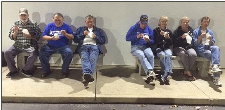
Right: Nothing beats ice cream after a hard day on the job